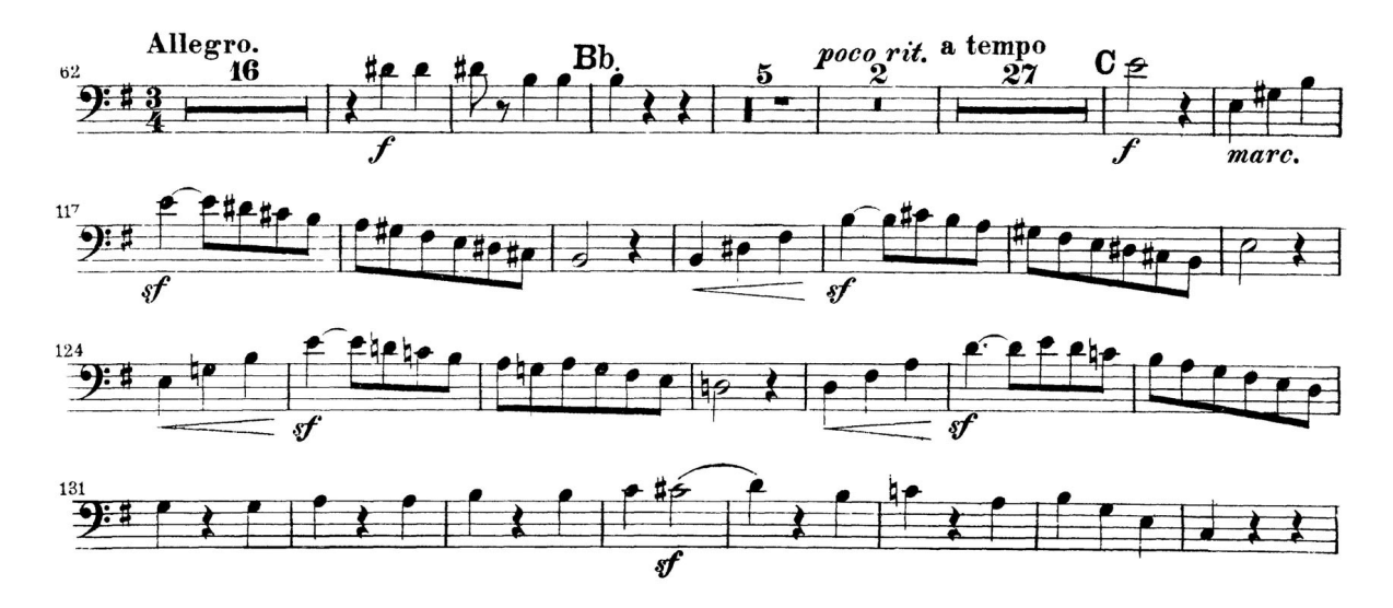
Rossini – La Gazza Ladra – Overture: mm. 115-138 (Trombone I)