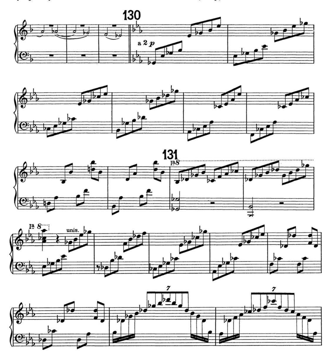
Elgar – Symphony No. 1 – Movement IV: Reh. 130-134 (Harp)